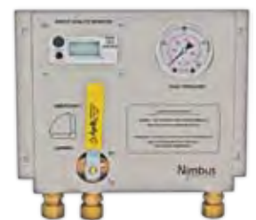
Remote bypass box option