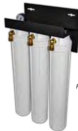
Filtration array option